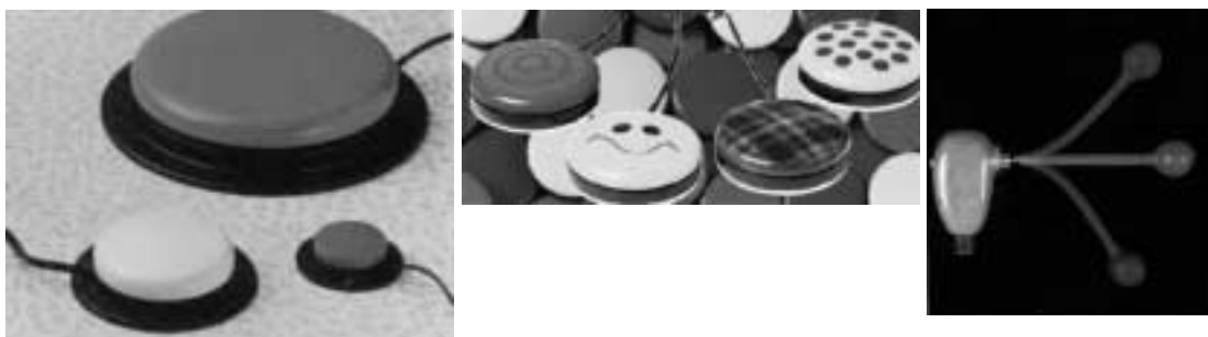
Figure 9-1 Big Red, Jelly Bean, Specs, Buddy Button and Ultimate switches

Most contact switches give feedback when they have been operated – perhaps an audible click or a beep. This feedback can make the switch easier to use because the user (and teacher or therapist) can tell when the switch is being activated.